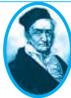
Carl Friedrich Gauss (1777 – 1855)

Carl Friedrich Gauss is often referred to as the 'Prince of Mathematicians' and is considered one of the three greatest mathematicians of all time, along with Archimedes and Newton. He has made fundamental contributions to both mathematics and science.